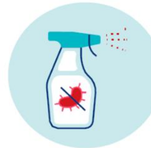
Clean surfaces frequently including door handles, rails, hoists etc.