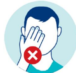
Avoid touching your face, nose and eyes