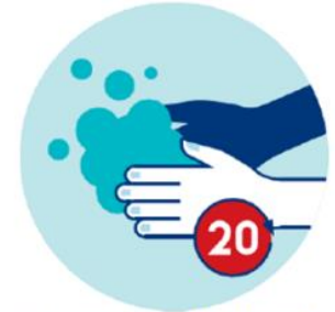
Wash hands frequently (for at least 20 seconds) or use a hand sanitiser with a minimum of 60% alcohol