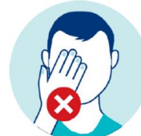
Avoid touching your face, nose and eyes

Carefully consider and control the in and out flow of groups, queuing systems and congestion risk with in the social distancing guidelines.