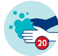
Wash hands frequently (for at least 20 seconds) or use a hand sanitiser with a minimum of 60% alcohol